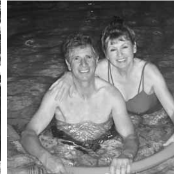
BEFORE THE RIDE ... AND AFTER!